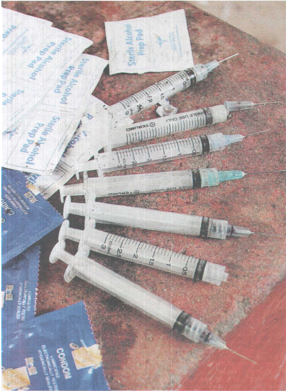
In the Needle Syringe Exchange Programme, drug addicts can get new needles and syringes after returning used ones.

Language English Page No 20 Article Size 448 cm 2 Color Full Color ADValue 13,252 PRValue 39,756