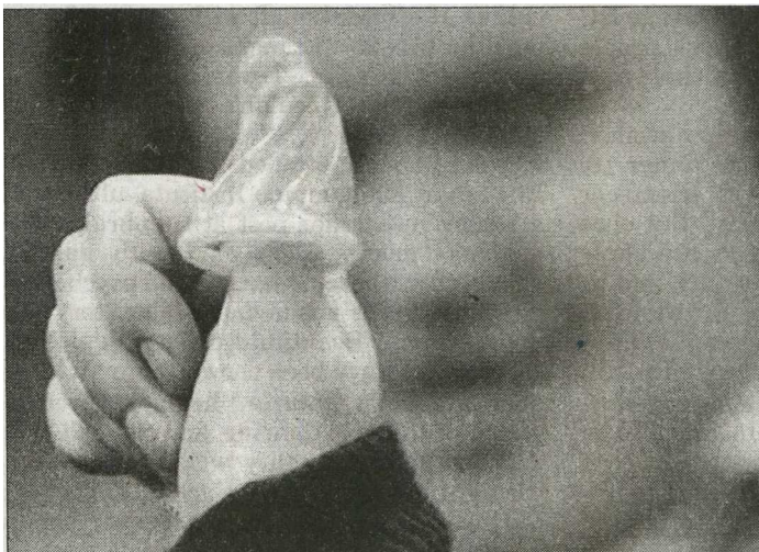
A woman displays a condom on her thumb.

The findings may make some people giggle, but the researchers said the implications were serious. Men will often not buy condoms sized "small" or even "medium," they said.