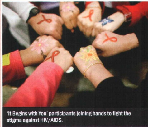
'It Begins with You' participants joining hands to fight the stigma against HIV/AIDS.

In partnership with the Malaysian Society for HIV Medicine and the Malaysian AIDS Council, MSD Malaysia commemorated International AIDS Memorial Day 2011 with an awareness programme entitled 'It Begins with You'. To mark the conclusion of the programme, a public event featuring interactive games and other activities was held at Berjaya Times Square, Kuala Lumpur.