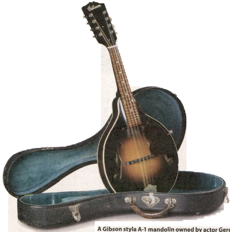
A Gibson style A-1 mandolin owned by actor Gere

A March auction of Eric Clapton's guitars, amplifiers and other memorabilia at Bonhams in New York raised US$2.2 million for the musician's Crossroads Centre Antigua, for drug and alcohol rehabilitation, almost four times its presale total of US$400,000 to US$600,000. The priciest item was a 1948 Gibson L-5P guitar that fetched US$82,960. — Bloomberg