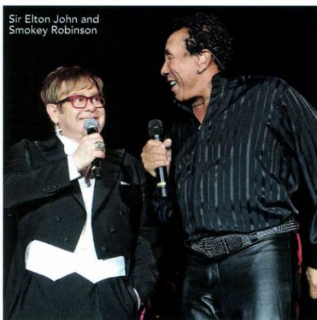
Sir Elton John and Smokey Robinson