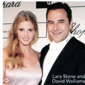
Lara Stone and David Walliams