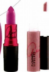
MAC Viva Glam Ariana Grande 2 Lipstick in Deep Cool Pink & Lipglass in Natural Nude Pink, RM78 each