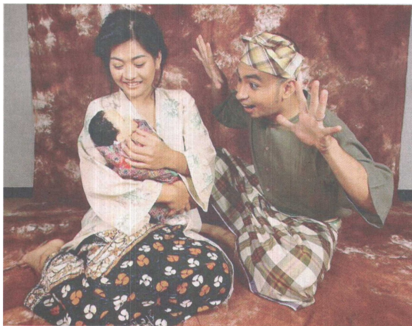
Folk tale: The Petronas Performing Arts Group presents Pak Pandir The Musical on June 17 and 18.