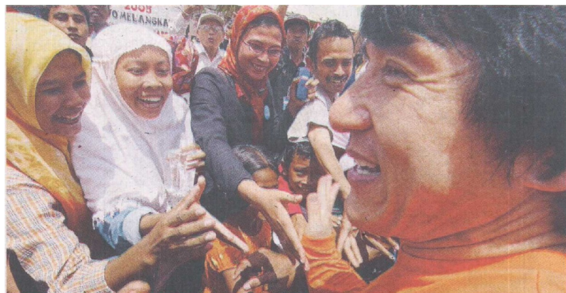
Hong Kong actor Jackie Chan greeting displaced Acehese in Banda Aceh, Indonesia, in 2005. Chan helped to rebuild a village there after the 2004 tsunami.