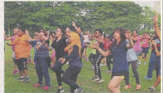
The participants clearly enjoying the workout.

"They were in need of financial assistance. Our contribution